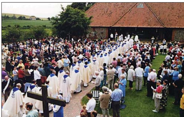
Open air Mass at the Shrine of Our Lady of Walsingham.