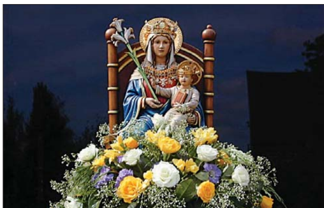
Statue of Our Lady of Walsingham